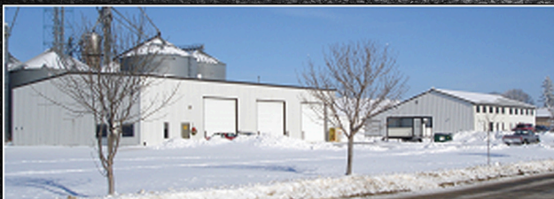
Our Engineering & Manufacturing Facilities

Systems Equipment Corporation has been manufacturing a complete line of controls and control-related components for the asphalt and aggregate industries since 1987.